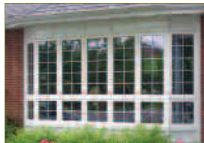
Bow (Casement and Picture combination)