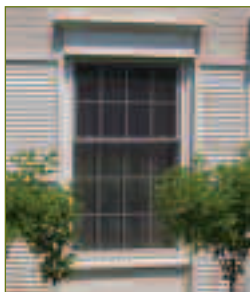
Single/Double Hung Window

SINGLE/DOUBLE HUNG • HALF ROUND • TRAPEZOID • ARCHES • OCTAGONAL • BAYS • BOWS CASEMENT • AWNING • PICTURE • SLIDER